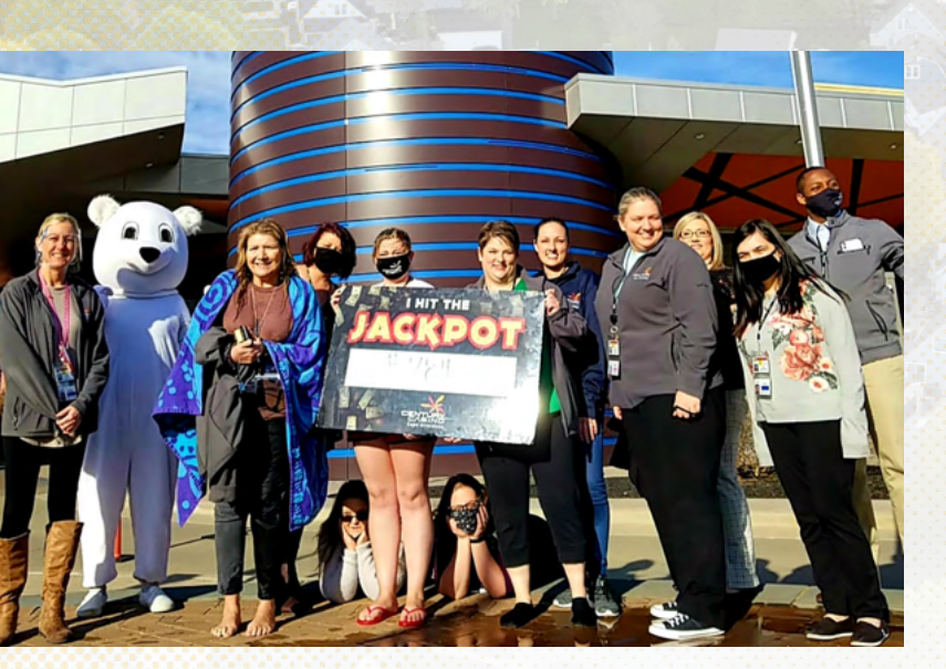
Century Casinos participated in the Polar Plunge for the Special Olympics of Southeast Missouri in February 2021. Team members paid to have ice water poured over a designated team member's head. We raised nearly $1,000,000 to support local Special Olympic athletes.