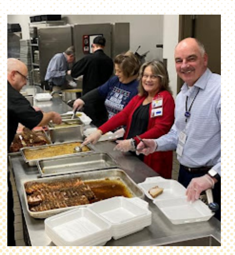
The Century Casino Cape Girardeau team prepared and served 300 meals on Christmas Day 2021 to people in need in our community through Student Santas.