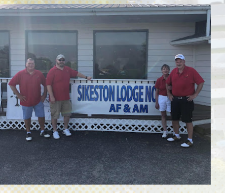
In June 2021, our team members participated in the Masonic Lodge Golf Tournament.

Charity Golf Events/Tournaments & Sponsorships