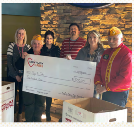
In December 2021, our Century Casino Cape Girardeau team collected toys and raised $500 for Toys for Tots through our Century Cares program.