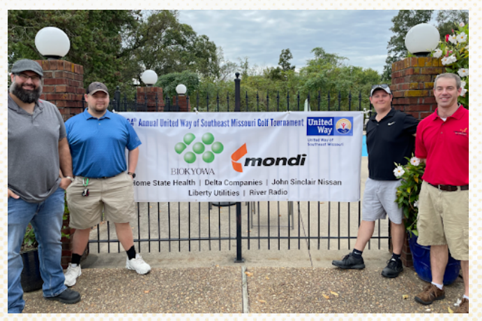
In October 2021, Century Casino Cape Girardeau team members participated in the annual United Way of Southeast Missouri Golf Tournament.