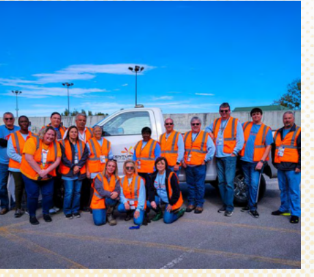
Century Casino Caruthersville participates in an Adopt A Highway program where team members volunteer to do a highway cleanup four times a year.