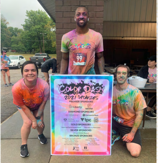
In October 2021, Century Casino Cape Girardeau team members participated in a Color Dash benefiting the Saint Francis Foundation—a non-profit organization that supports the efforts of the Saint Francis Healthcare System in meeting the medical needs of patients in the region.