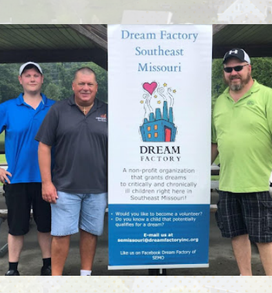
Century Casino Cape Girardeau team members participated in the Dream Factory of Southeast Missouri Golf Tournament in August 2021. This nonprofit organization grants dreams to critically and chronically ill children in Southeast Missouri.