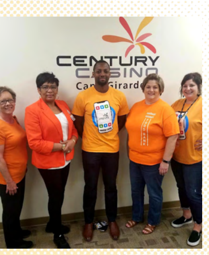
Century Casino Cape Girardeau team members wore orange attire to raise awareness about domestic hunger on National Hunger Day in September 2021.

Century Casinos is on a mission to fight hunger in our communities. During the past few years, we've provided food donations to people in need during the holidays and collected food for our local food banks. Century Casinos donated 500lbs of food in 2021. We're also working to raise awareness about the growing problem of domestic hunger through awareness projects that encourage our Century Casinos family to take action. Thanks to the generosity of our guests, team members and corporate team, we can help give back to local communities.