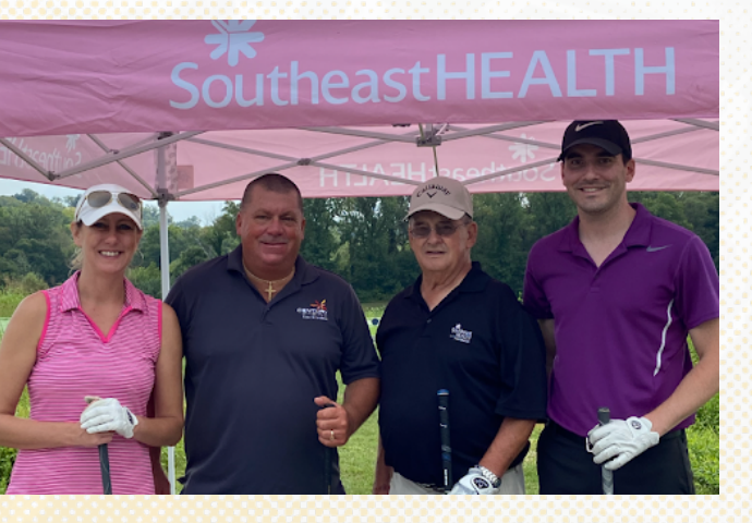
Century Casinos team members participated in the Southeast HEALTH Foundation Golf Tournament in September 2021. Proceeds for the tournament benefit programs such as transportation for hospice patients, medications for low-income patients, bereavement and counseling services and more.

In August 2021, Century Casino Cape Girardeau team members participated in The Friends of Saint Francis Golf Tournament. Proceeds for this annual four-person scramble go to feed hungry children in Cape Girardeau.